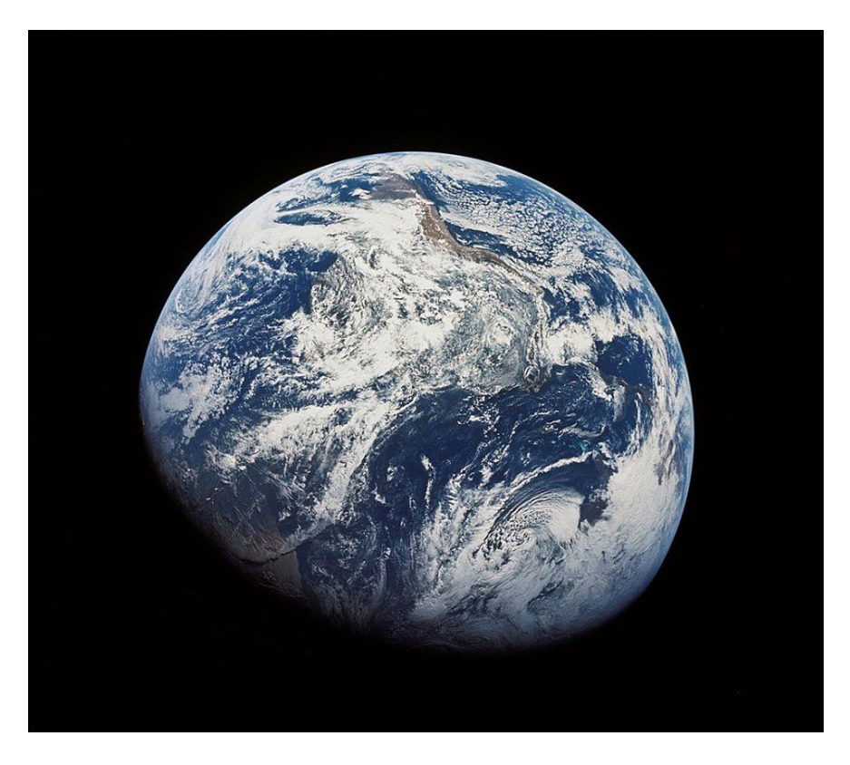
Figure 1. The first photograph of the Earth with a view from space taken by the Apollo 8 crew (Frank Borman, James Lovell and William Anders) in December 1968.

Mother Earth. Perhaps today contemplation of it is enough, as in the case of the Apollo 8 astronauts who in December 1968 took the first photograph of the Earth from space ( Figure 1 ).